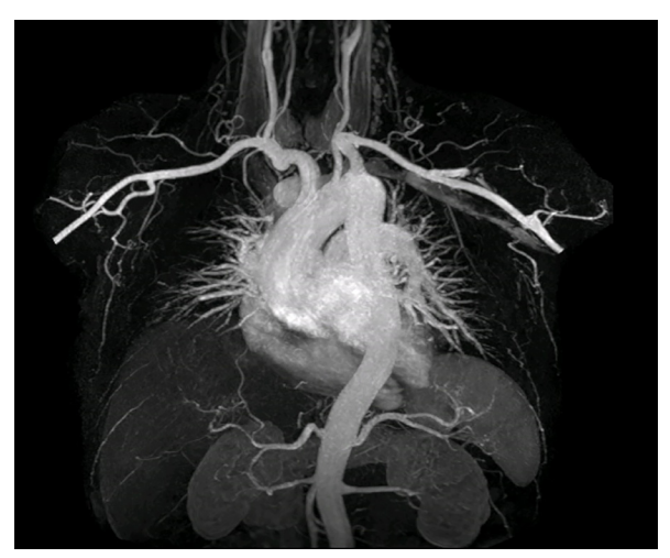
mDIXONMRA in chest. FOV 430 mm, voxels 1.3 x 1.3 x 3.0 mm, 130 slices, breath hold 16.6 sec. Performed on Ingenia Ambition.

non-contrast-enhanced sequences. We try to minimize the amount of contrast agent we use, and we're now able to do that because of the imaging power of the scanner," Dr. Pena explains.